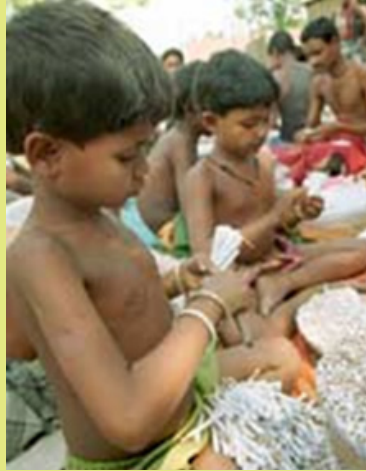
Little boys engaged in rolling bidis in Andhra

the tobacco sector lose their future, because they either cannot attend