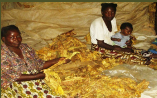
Women grading tobacco leaf in an enclosed warehouse with no ventilation