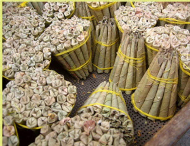
Small bidi bundals, sold between INR 3.5 to 10 (USD 0.6 - 0.15)

Conservative numbers estimate about 5.5 million